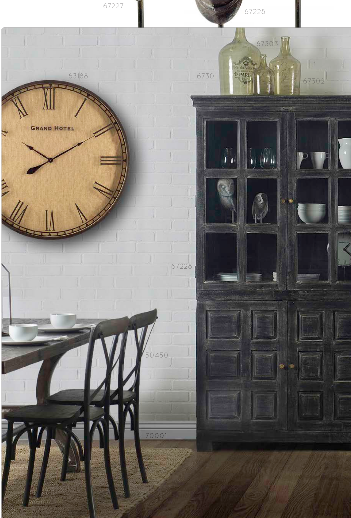
Winter 2018 | 8